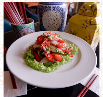
Baby Octopus Salad