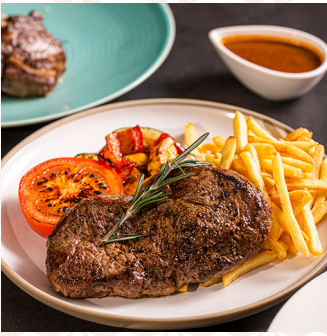
Black Pepper Rib-eye Steak