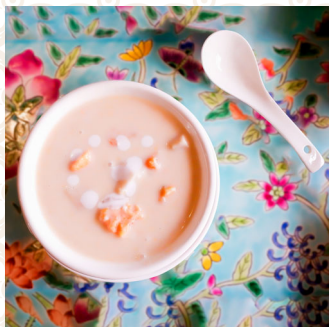
Bubur Cha Cha