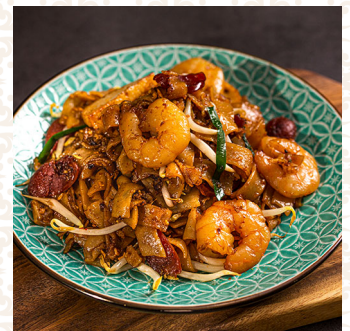
Char Kway Teow