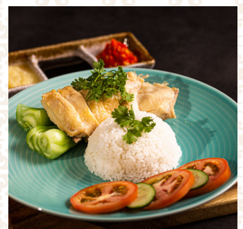
Singapore Chicken Rice