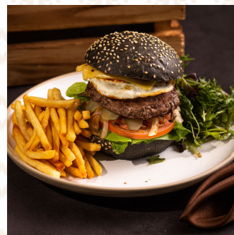
Grilled "Black Angus" Beef Burger

Juicy beef patties grilled to perfection in between a freshly baked charcoal bun topped with peanut butter, lettuce, tomatoes, caramelised onions, turkey bacon, gherkins, English cheddar and topped with a sunny side up.