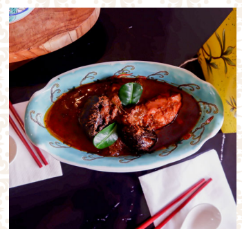
Ayam Buah Keluak