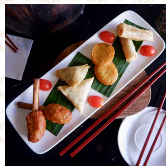
Mixed Appetiser Platter