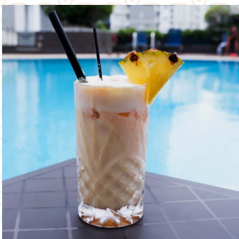
Dainty Tai Tais