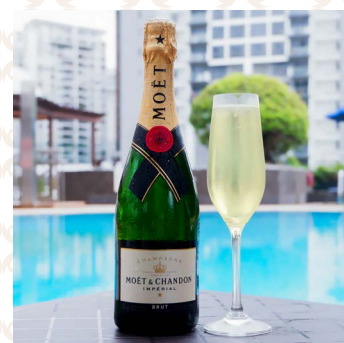
Moët & Chandon Champagne