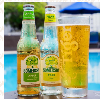
Somersby Apple, Somersby Pear, Tiger Beer (Draught)