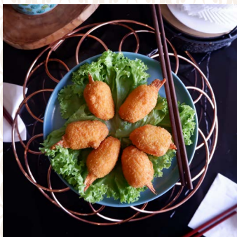
Breaded Crab Claw