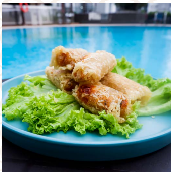
Mini Spring Rolls