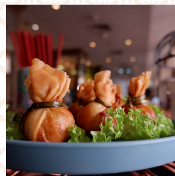
Money Bags Chicken