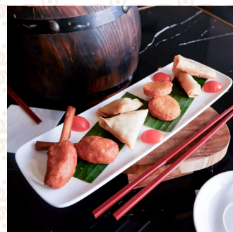
Mixed Appetiser Platter

12 sticks of skewered, grilled meat served with peanut gravy, rice cakes, cucumbers & diced onions. Choice of meat: Chicken or Beef.