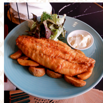
Fish & Chips

250g Rib-eye served with fries, sauteed seasonal greens, grilled tomatoes, and black pepper gravy.