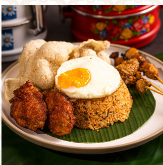
Traditional Nyonya Nasi Goreng Istimewa