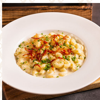
Mac 'n' Cheese