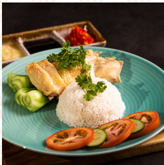
Singapore Chicken Rice