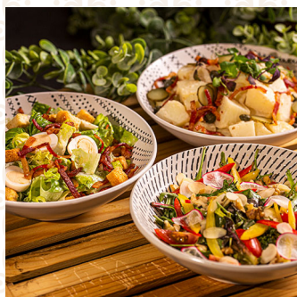
Caesar Salad, English Pub Potato Salad, Garden Salad