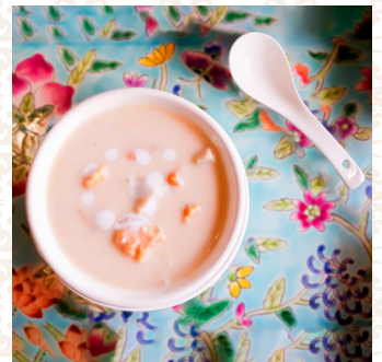
Bubur Cha Cha

Rich and creamy custard topped with caramelised sugar.