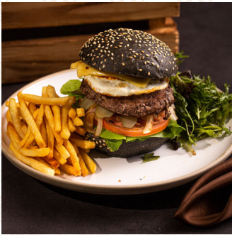
Grilled "Black Angus" Beef Burger